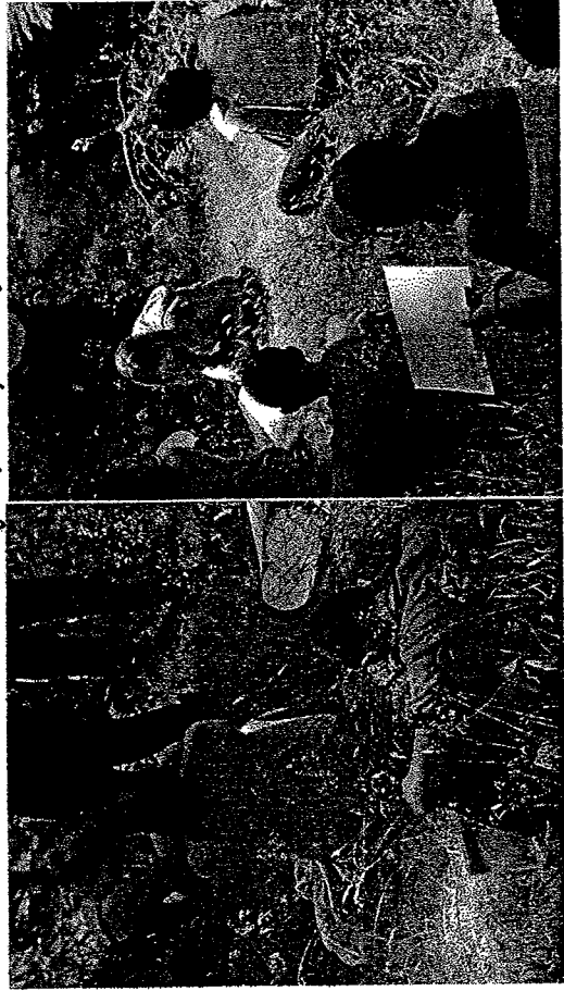
Students taking part in an outdoor activity session, followed by the generation of philosophical questions

(Places on this course are subsidised by DFID's Going Global in the Outdoors Project, led by CDEC)